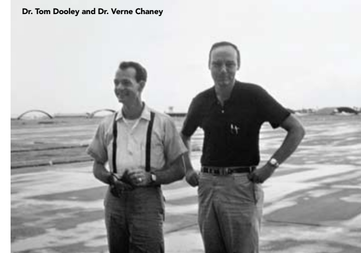
Dr. Tom Dooley and Dr. Verne Chaney

Chaney recalls, "Dooley was a former ship's doctor in the U.S. Navy in the 1950s serving in Vietnam and was appalled by the plight of refugees of the First Indochina War (1946-50) who had no medical